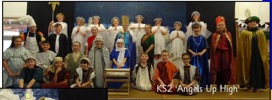
KS2 'Angels Up High'