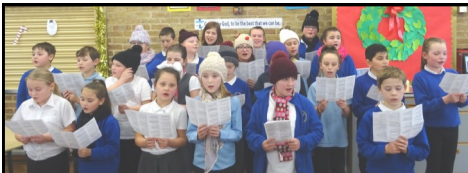
Our wonderful choir spread Christmas cheer by entertaining residents at the Lawns and Rosemary Court.

We had a busy but joyous end of term. All the children shone when EYFS, KS1 and KS2 gave fantastic shows to proud mums and dads. Many parents and visitors commented on the quality of the singing and acting which was exceptional. Well done children, you were amazing and made us all very proud.