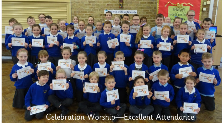
Celebration Worship—Excellent Attendance

Well done to all 48 children who managed to achieve 100% attendance last term or achieved over 98%, despite all the nasty bugs going around! Our attendance for last term has never been so low (95.5%) so we hope the holiday and recent cold spell has killed off the bugs as we work towards our target of 96.4%. Well done to Years 2, 3 and 6 for reaching target last term.