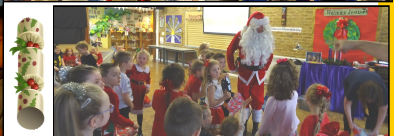
Father Christmas came to our parties!