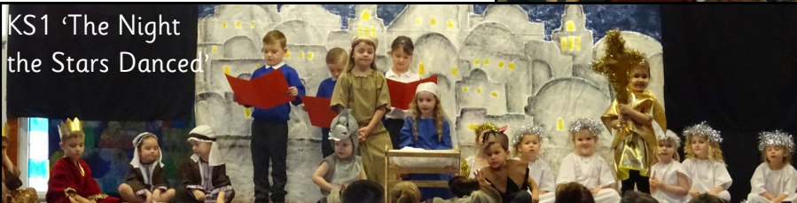
KS1 'The Night the Stars Danced'